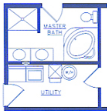
Master bath/utility option

The options shown to the right are available in the Richmond Home.