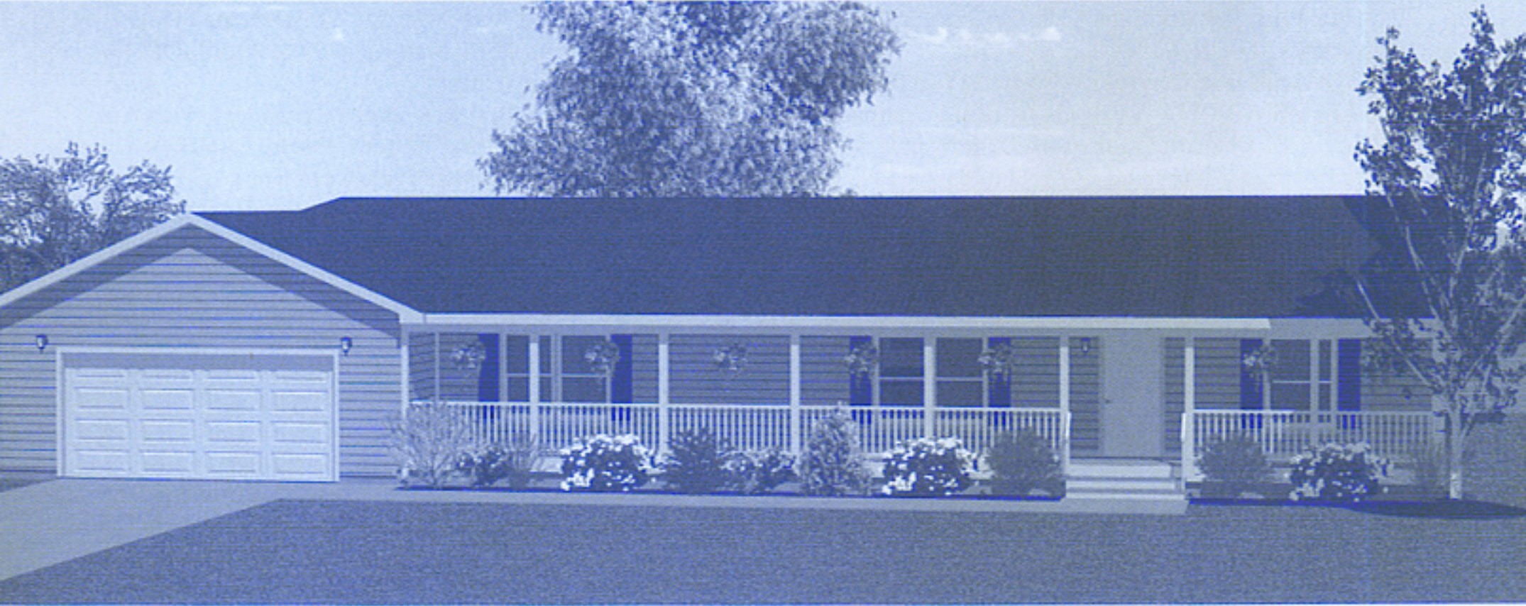
HUNTINGTON 28' x 64' • 1,792 sq. ft.